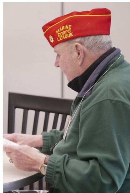
Dadgumit, I can't find my glasses.