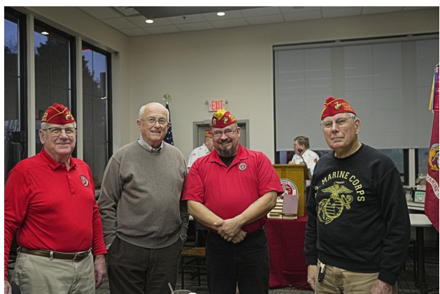
Friends having a great time together.