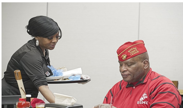
Sir, is this your third serving?