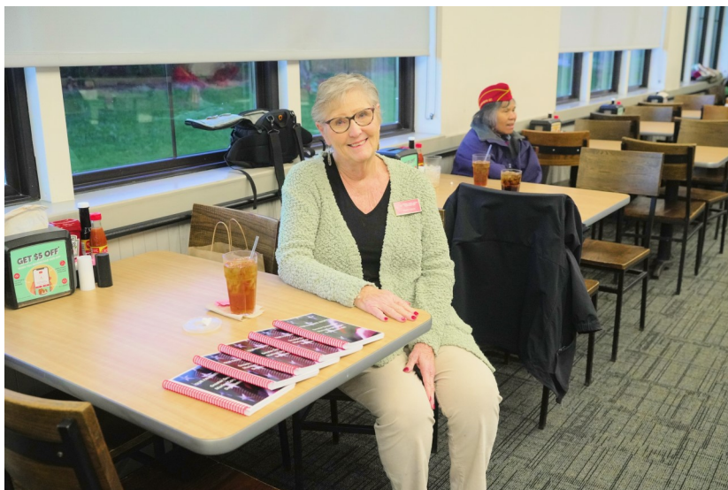
DETACHMENT COOK BOOKS FOR SALE