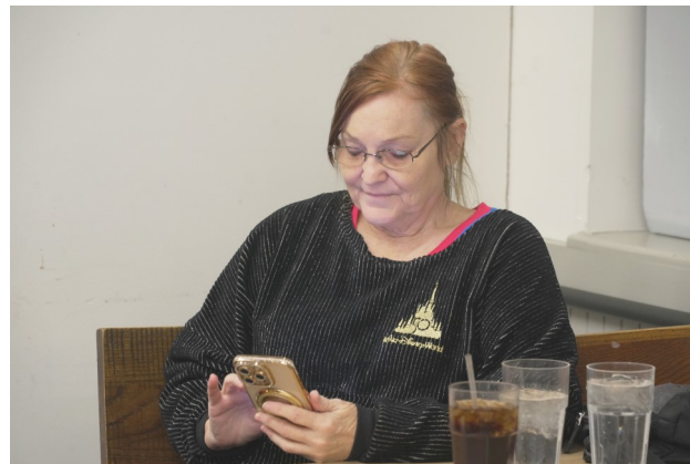
The Winning Power Ball Number is.....