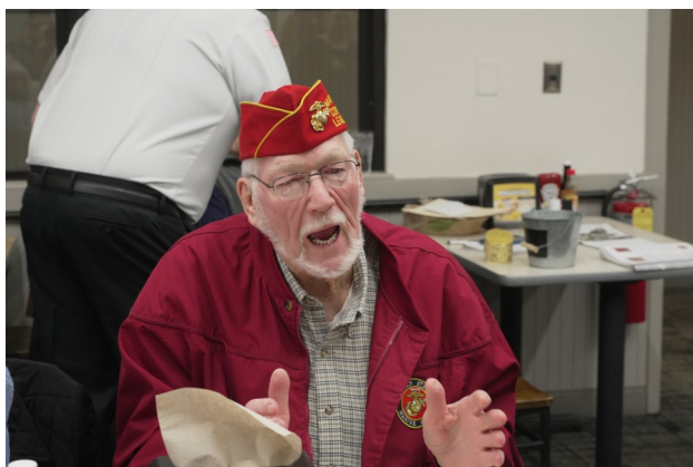
Are you deaf? I know I told this to you before.