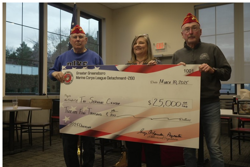
A $25,000 check from the Detachment to the Servant Center

Tues, April 29-Fun Night Out at Rody's Tavern 5:30 to ??? Good Food and Conversation